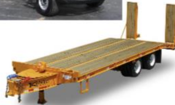
Similar Type Vehicles (Exemplars)